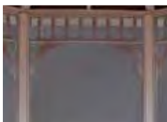
Screen System for Vinyl or Wood Gazebos