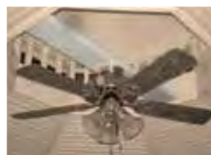
Ceiling Fan Support standard