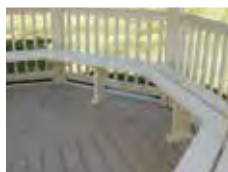
Benches for Vinyl or Wood Gazebos